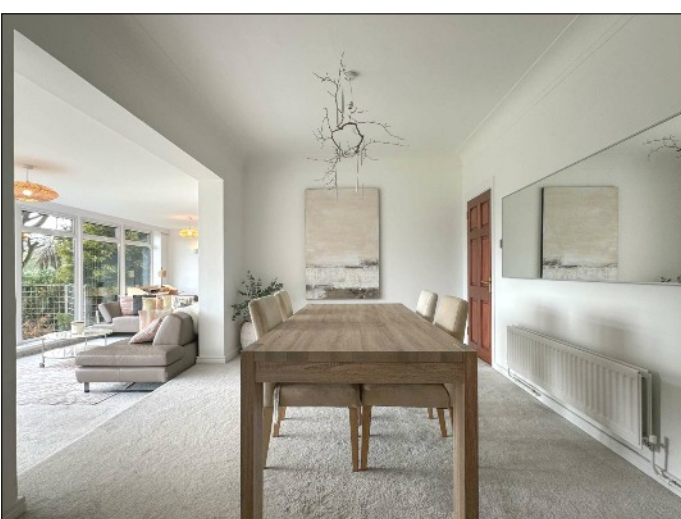
Dining Room: 15' 1" X 9' 8" (4.6m X 2.95m) With coving.