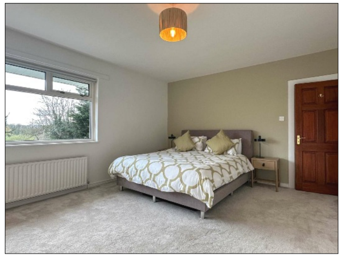
Bedroom 3: 15' 3" X 13' 0" (4.65m X 3.96m) With built in mirrored sliderobes and drawers.