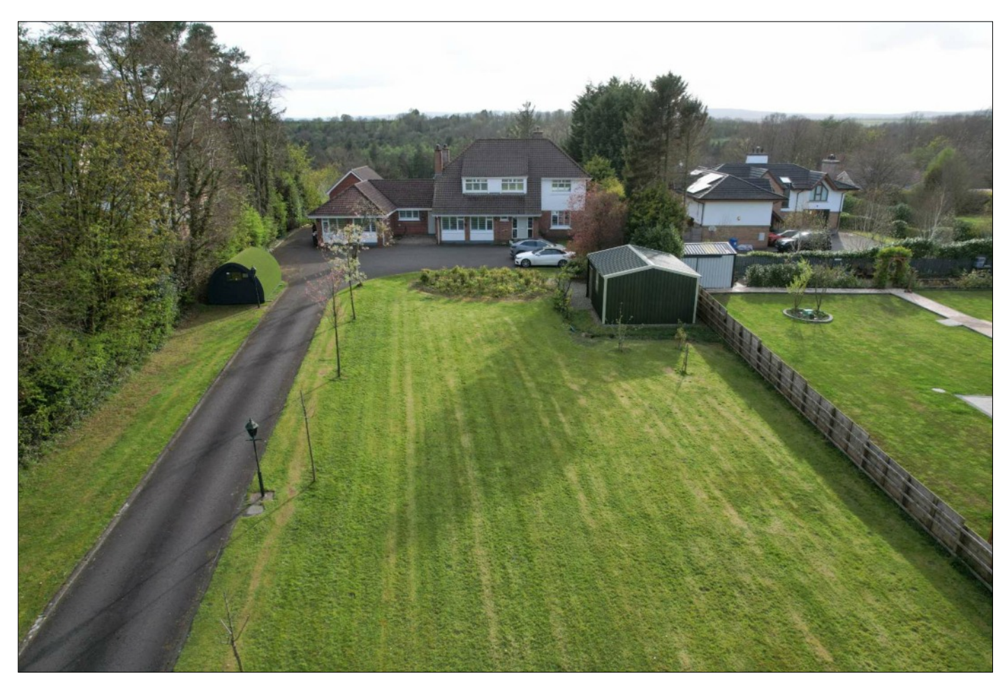
209 Mountsandel Road, Coleraine, BT52 1TB