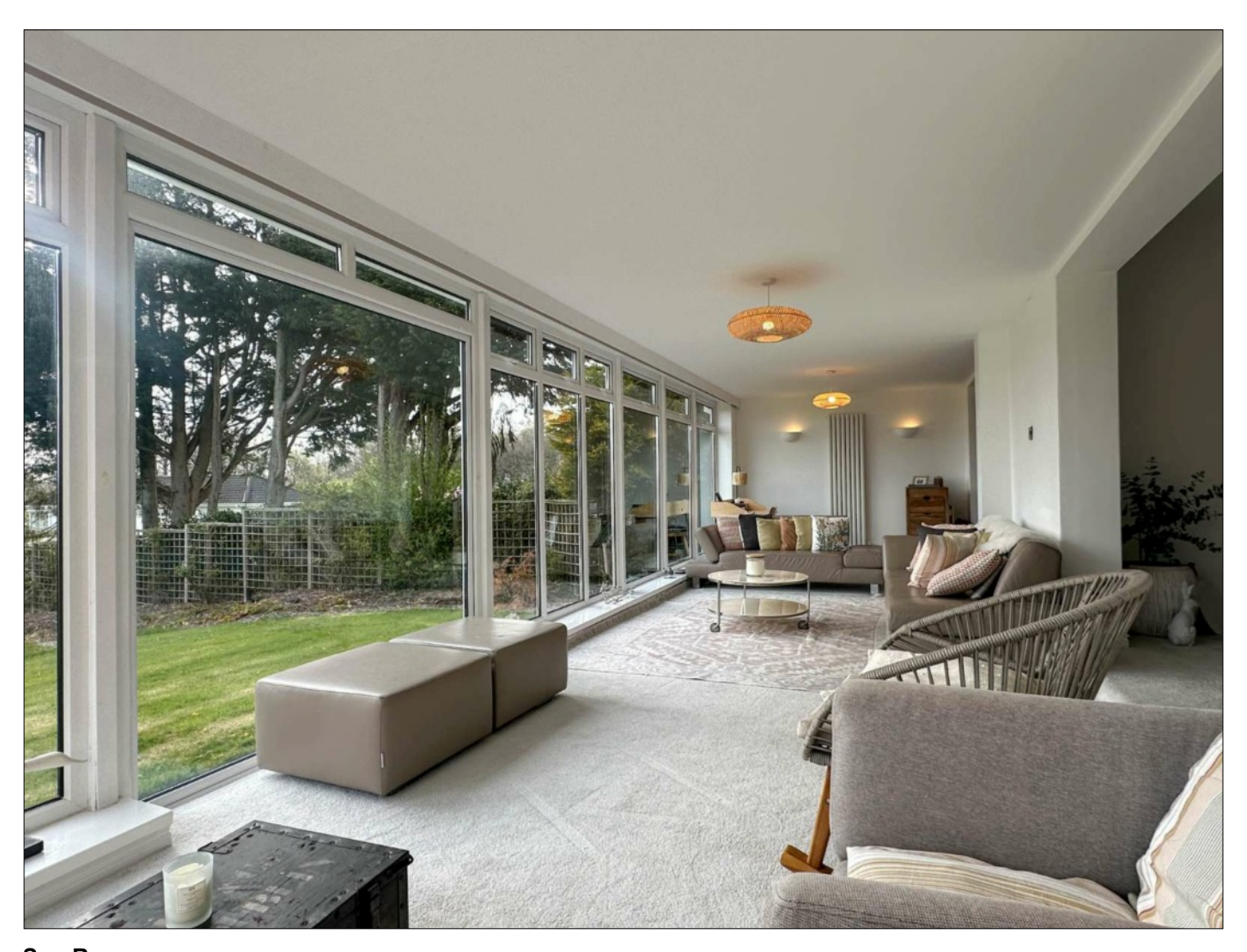
Sun Room: 34' 6" X 10' 4" (10.52m X 3.15m) Views of the River Bann. Open plan to dining room.