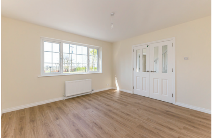
FAMILY ROOM: 12' 8" \times 12' 6" ( 3.86m \times 3.81m ) Wood strip flooring, feature fireplace with wooden surround and tiled inset, double doors to rear.