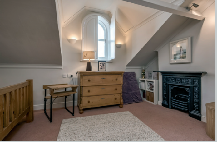
BEDROOM (5): 14' 4" x 13' 10" (4.37m x 4.22m) Velux window, cast iron fireplace.