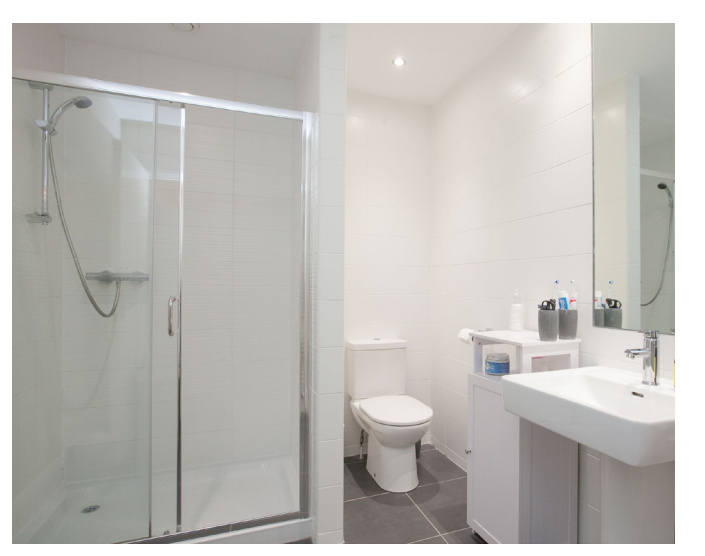
Ensuite shower room