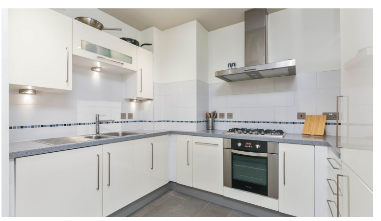
Luxury fitted kitchen