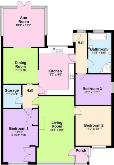
81 Drumaness Road, Ballynahinch