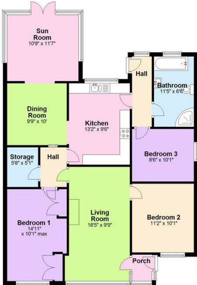
81 Drumaness Road, Ballynahinch