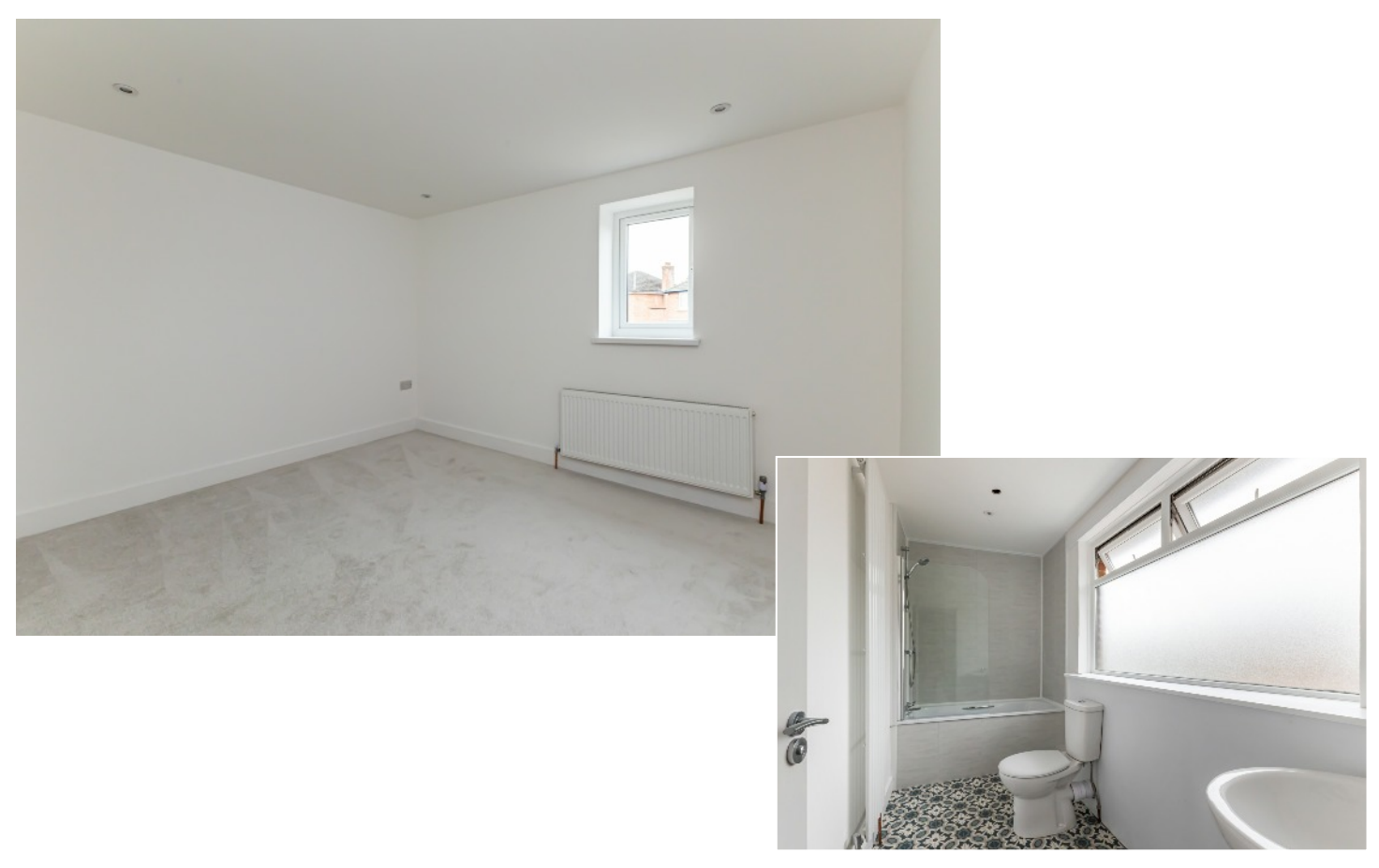
BEDROOM (2): 10' 9" x 10' 5" (3.28m x 3.18m) Outlook to front.

ENSUITE BATHROOM: White suite comprising low fush wc with push button, pedestal wash hand basin with chrome mixer tap, tiled panelled bath with chrome mixer tap, fixed glass door with chrome thermostatic control valve and telephone attachment for shower, frosted glass window, floor to ceiling radiator.