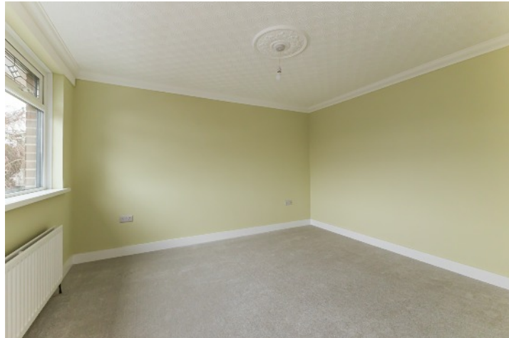
BEDROOM (4): 10' 0" x 8' 5" (3.05m x 2.57m) Outlook to side.