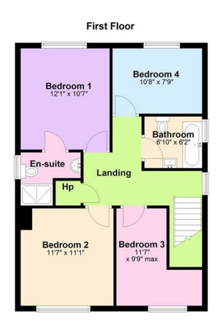
2 St. Patricks Way, Ballyalton, Downpatrick

Terms & Conditions: Please note that these particulars do not constitute an offer or contract of sale. Any prospective purchaser should satisfy themselves by thorough inspection of the property and we recommend that any prospective punchaser should employ the professional services of a building surveyor and consider their findings prior to entering into contract. All such fees associated with this work will be the responsibility of the prospective punchaser regardless of weather the sale completes or not. In addition, now of the applicances net tested in any way whatsoever and it is our recommendation that a punchaser should fully satisfy themselves by employing an appropriate expert. We would also like to advise that our measurements are taken from the widest points of each room and should not be relied upon as completely accurate. You should not make decisions besed on the measurements provided and double check measurements at all times. Valuation/Windrages Service As part of our service we would remind Vendors and potential punchasers that we have a Mortgage Broker available at this branch. If you are thinking of selling, we would be happy to carry out if ner market appraisal of your property.