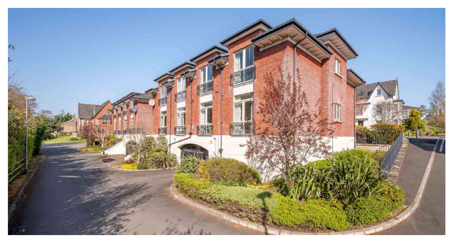
TOP FLOOR APARTMENT | 1 \rightleftharpoons | 1 \leftrightarrows | 1 \boxminus

This spacious and extremely well presented top-floor apartment is ideally situated within walking distance to King's Square and Cherryvalley with its excellent range of shops and cafes.