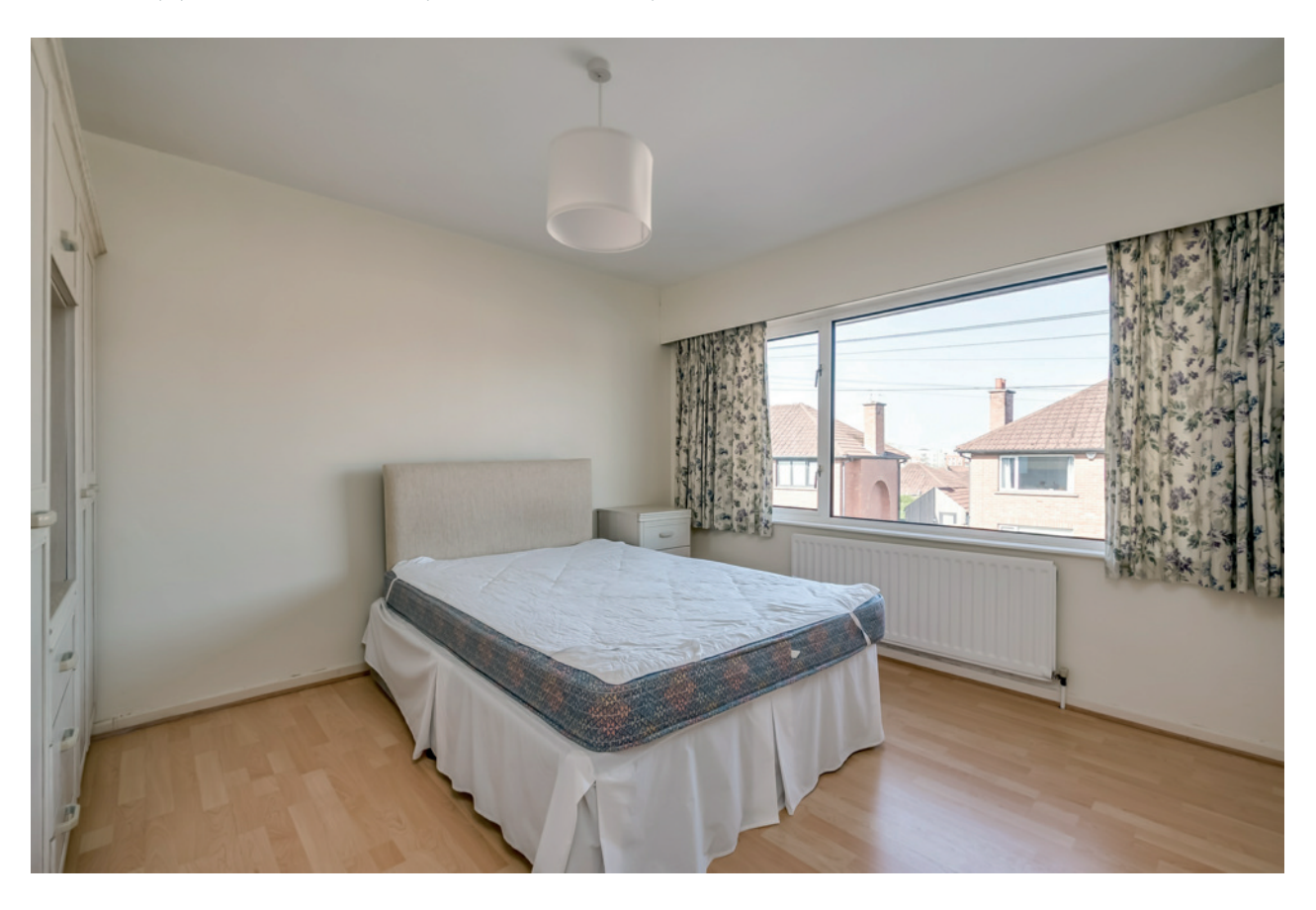
BEDROOM (2): 11' 6" \times 10' 8" (3.51m \times 3.25m) Laminate wood effect floor, range of built-in robes.

BEDROOM (1): 12' 4" \times 10' 8" (3.76m \times 3.25m) Laminate wood effect floor.