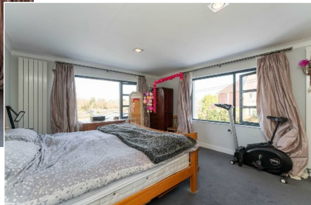
BEDROOM (3): 13' 1" x 11' 7" (3.99m x 3.53)