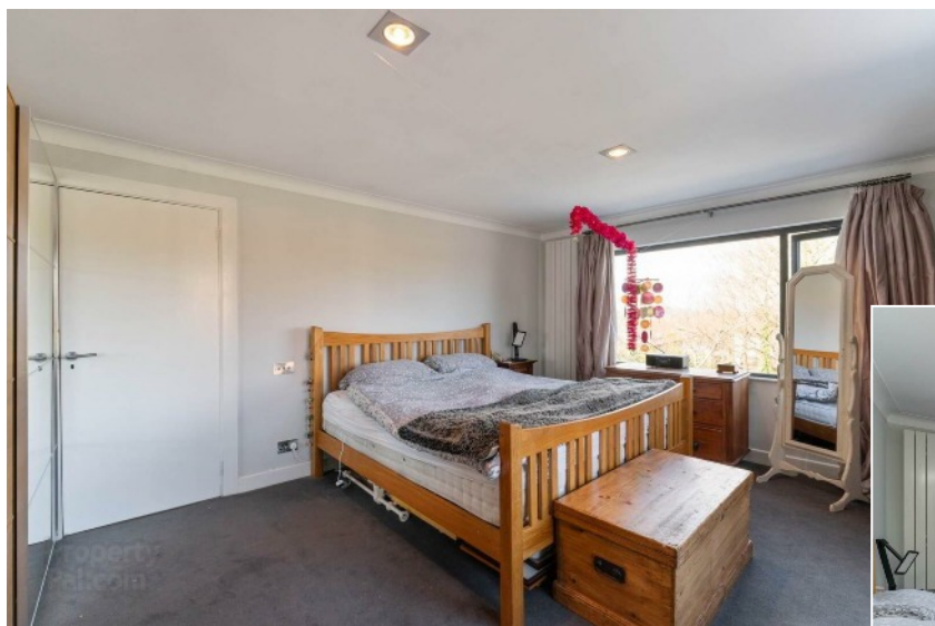
BEDROOM (2): 16' 8" x 10' 9" (5.08m x 3.28m)