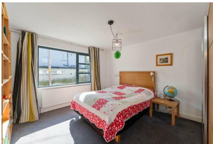
BEDROOM (4): 9' 4" x 8' 11" (2.84m x 2.72m)