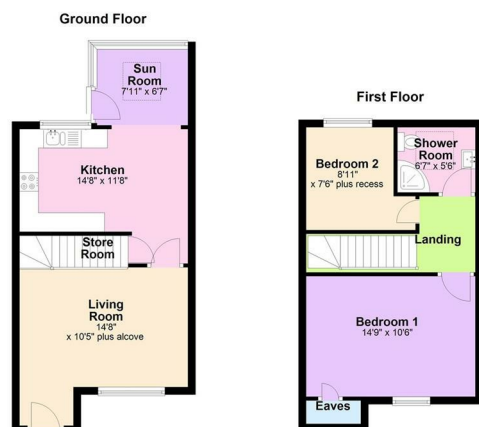
34 Struell Crescent, Downpatrick

Terms & Conditions: Please note that these particulars do not constitute an offer or contract of sale. Any prospective purchaser should satisfy themselves by thorough inspection of the property and we recommend that any prospective purchaser should employ the professional services of a building surveyor and consider their findings prior to entering into contract. All such fees associated with this work will be the responsibility of the prospective purchaser regardless of whether the sale completes or not. In addition, none of the appliances or installations have been tested in any way whatsoever and it is our recommendation that a purchaser should fully satisfy themselves by employing an appropriate expert. We would also like to advise that our measurements are taken from the widest points of each room and should not be relied upon as completely accurate. You should not make decisions based on the measurements provided and double check measurements at all times. Valuation/Mortgage Service: As part of our service we would remind Vendors and potential purchasers that we have a Mortgage Broker available at this branch. If you are thinking of selling, we would be happy to carry out a free market appraisal of your property.