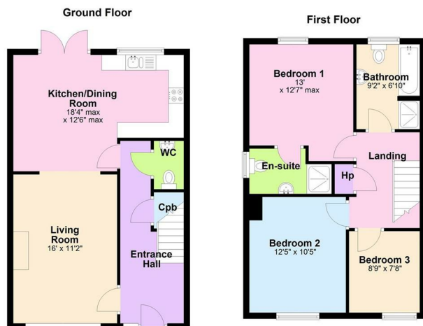
19 Pheasant Hill, Ballynahinch

Terms & Conditions: Please note that these particulars do not constitute an offer or contract of sale. Any prospective purchaser should satisfy themselves by thorough inspection of the property and we recommend that any prospective purchaser should employ the professional services of a building surveyor and consider their findings prior to entering into contract. All such fees associated with this work will be the responsibility of the prospective purchaser regardless of whether the sale completes or not. In addition, none of the appliances or installations have been tested in any way whatsoever and it is our recommendation that a purchaser should fully satisfy themselves by employing an appropriate expert. We would also like to advise that our measurements are taken from the widest points of each room and should not be relied upon as completely accurate. You should not make decisions based on the measurements provided and double check measurements at all times. Valuation/Mortgage Service: As part of our service we would remind Vendors and potential purchasers that we have a Mortgage Broker available at this branch. If you are thinking of selling, we would be happy to carry out a free market appraisal of your property.