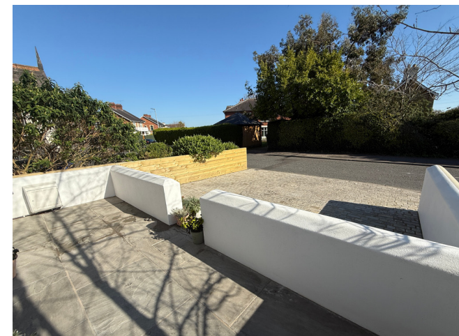
Sitting area to the front