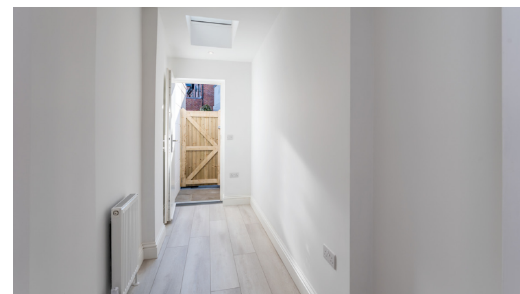
Inner hallway and storage