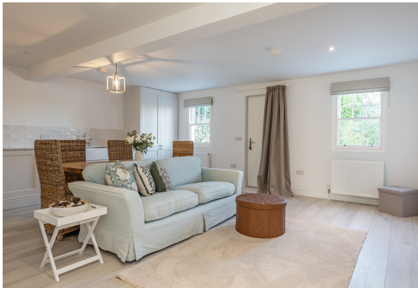
Living room open to kitchen and dining