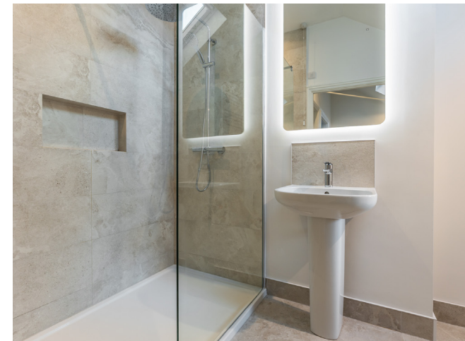
Luxury shower room