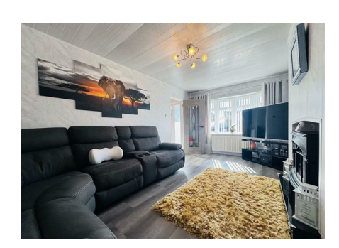
74 Tudor Park Mallusk, Newtownabbey, BT36 4FT