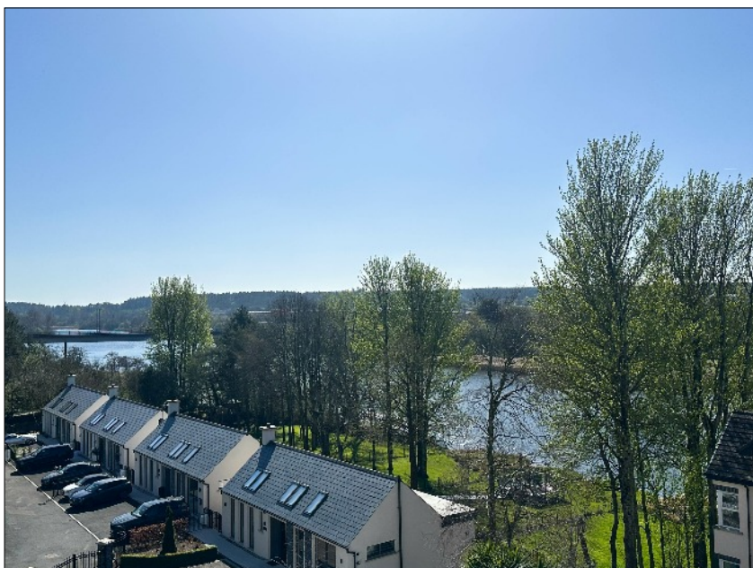
Balcony: With outside light, stunning River Bann views.