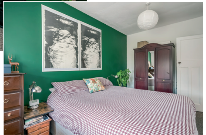
BEDROOM (2): 9' 10" x 8' 7" (3m x 2.62m) Dual aspect windows. Views to Antrim Hills. Picture rail. Views to Black Mountain.