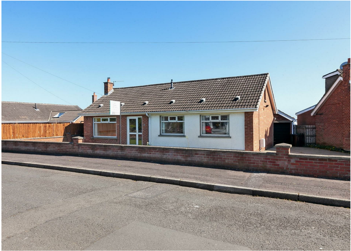
2 Downhill Park, Newtownabbey, BT36 6TX