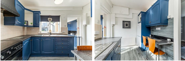
Kitchen 11'10" x 7'0"

Range of high and low level kitchen cabinets with breakfast bar area, single radiator with modern grey flooring.