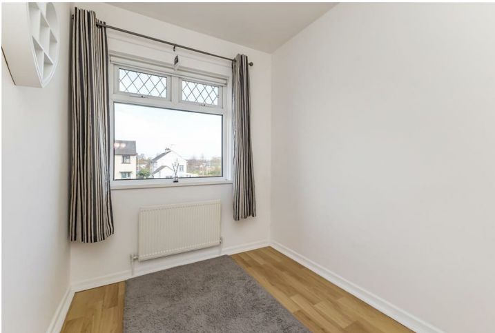
Single Bedroom with laminate flooring, built in storage area and single radiator.