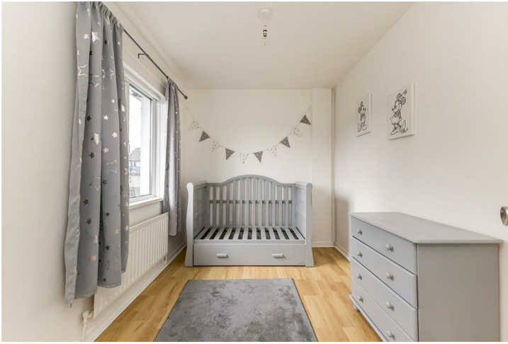
Laminate flooring & single radiator