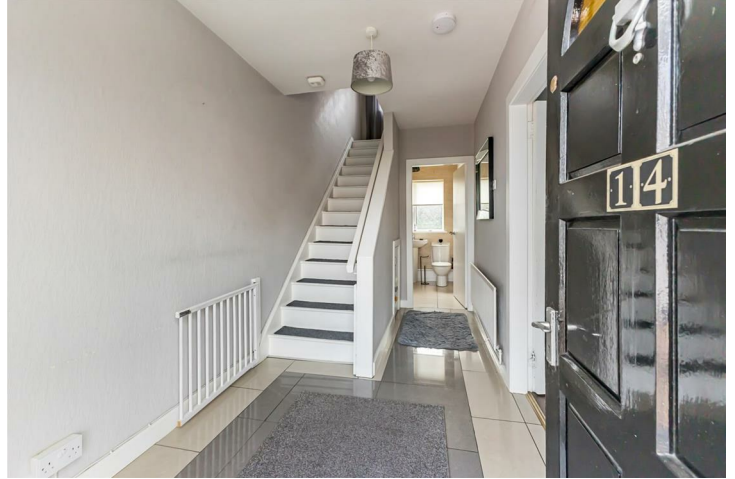
Entrance hall 6'0" x 12'10"

A bright and welcoming entrance with tiled floor & single radiator.