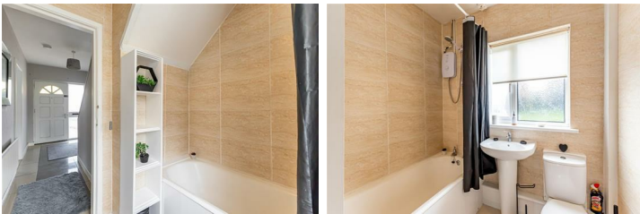
Bathroom 6'0" x 7'0"

A bright and spacious living area with modern fireplace with back boiler, dark laminate floor, single radiator & bay window.