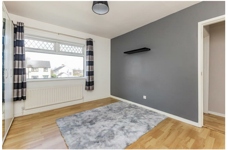
Principal Bedroom 11'4" x 12'2"

Principle bedroom at the front of the house with laminate flooring & single radiator.