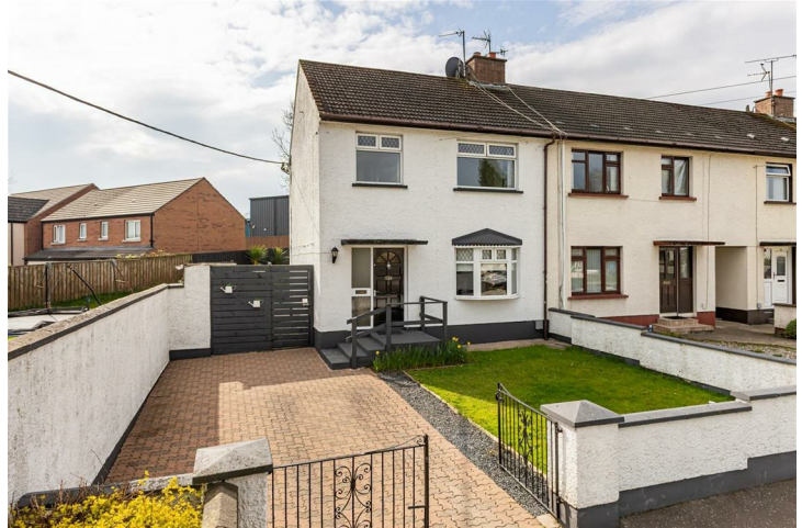
Driveway with gated, paved area at the front of the house with a well maintained lawn area.