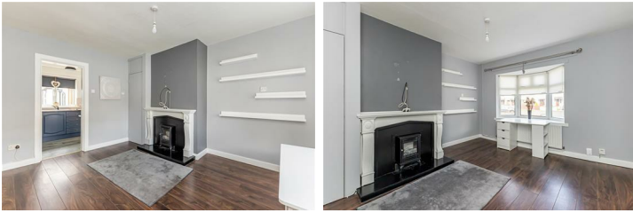
Living room 11'10" x 12'10"

A bright and spacious living area with modern fireplace with back boiler, dark laminate floor, single radiator & bay window.