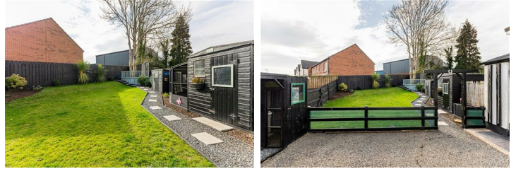
Well maintained gravel and lawn area with storage sheds, gravel path and enclosed fence.