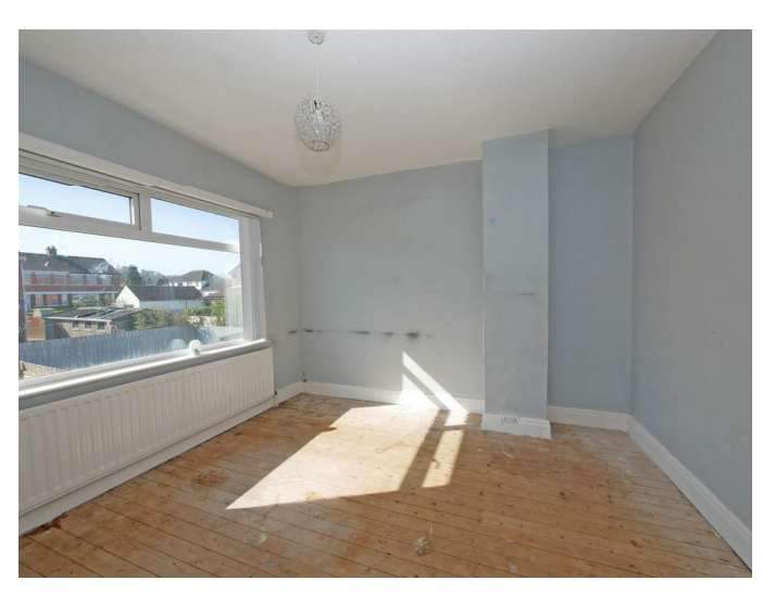
Bedroom 3 8'8 x 7'4 (2.64m x 2.24m)