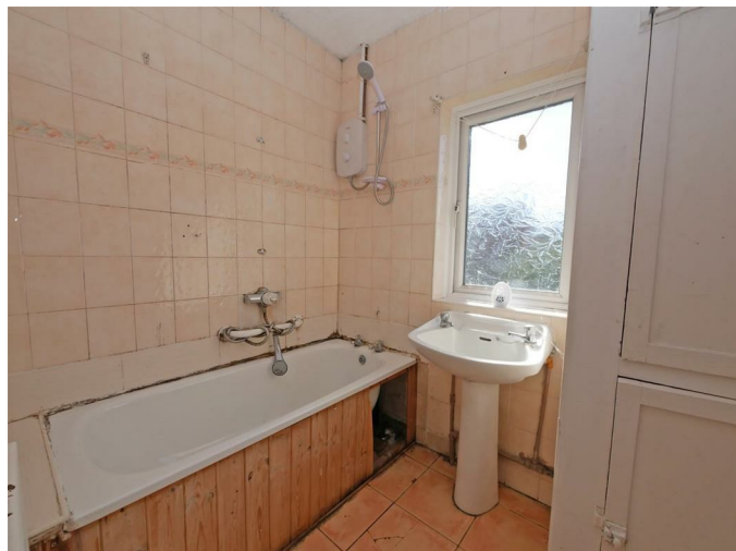
Bathroom 7'1 x 5'5 (2.16m x 1.65m)

White suite comprising panelled bath, Electric shower above, pedestal wash hand basin, fully tiled walls, tiled floor, hot press.