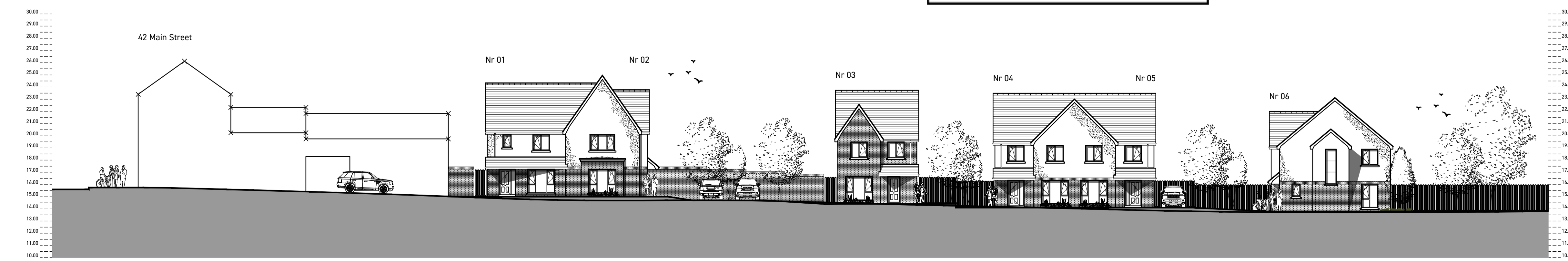
SECTION A-A (1:200)