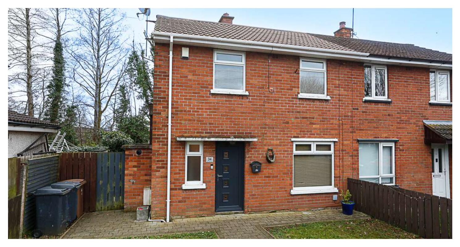
SEMI-DETACHED | 2 ⊨ | 1 ≒ | 1 ⊟

34 Knocknagoney Park is a beautifully presented semi-detached home that will appeal to a wide range of buyers and is sure to attract immediate interest. This is a fantastic opportunity to acquire a well-maintained property in a sought-after