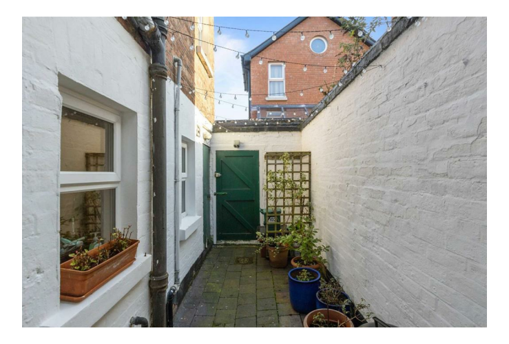
Enclosed rear yard with outside storage.

Bathroom 9'1" x 4'3" (At widest points) (2.77 x 1.30 (At widest points))