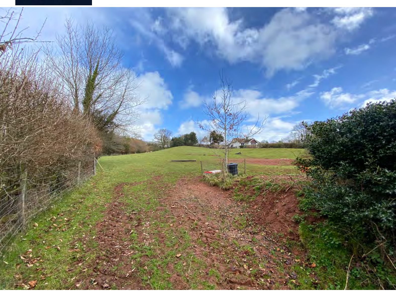
Guide Price - £160,000