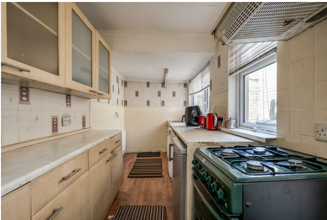
Excellent range high and low level units, stainless steel sink unit with mixer tap,

plumbed for washing machine, part tiled walls and vinyl floor. Under stairs storage.