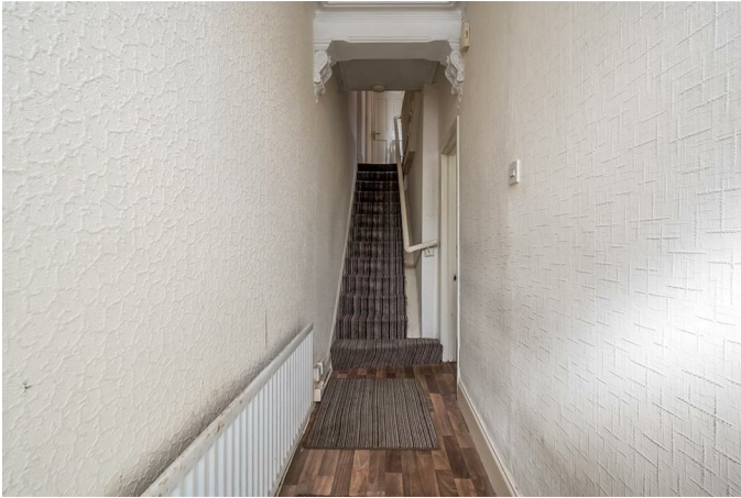
PVC front door and vinyl flooring. Feature cornice