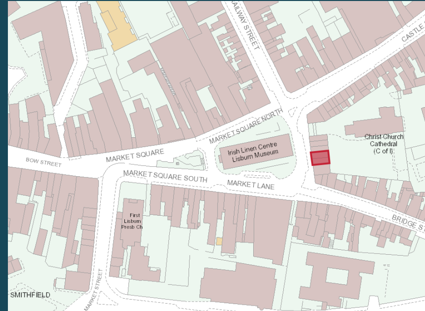
Layout Plan - Not to Scale

McKIBBIN COMMERCIAL PROPERTY CONSULTANTS for themselves and the vendors or lessors of this property whose agents they are given notice that: 1) The particulars are produced in good faith, are set out as a general guide only and do not constitute any part of the contract; 2) No person in the employment of McKIBBIN COMMERCIAL PROPERTY CONSULTANTS has any authority to make or give any representation or warranty whatever in relation to this property. As a business carrying out estate agency work when we enter into a relationship with a customer, we are required, if applicable, to verify the identity of both vendor and purchaser as outlined in the Money Laundering, Terrorist Financing and Transfer of Funds (information on the payer) Regulations 2017 – http://www.legislation.gov.uk/uksi/2017/692/made . In accordance with legislation, any information and documentation provided by you will be held for a period of five years from when you cease to have a contractual relationship with McKibbin Commercial. The information will be held in accordance with the General Data Protection Regulations (GDPR) and will not be passed on to any other party unless we are required to do so by law.