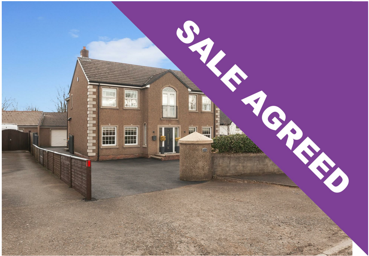
'Cartmel', 143a Hillhead Road, Ballyclare, BT39 9LN