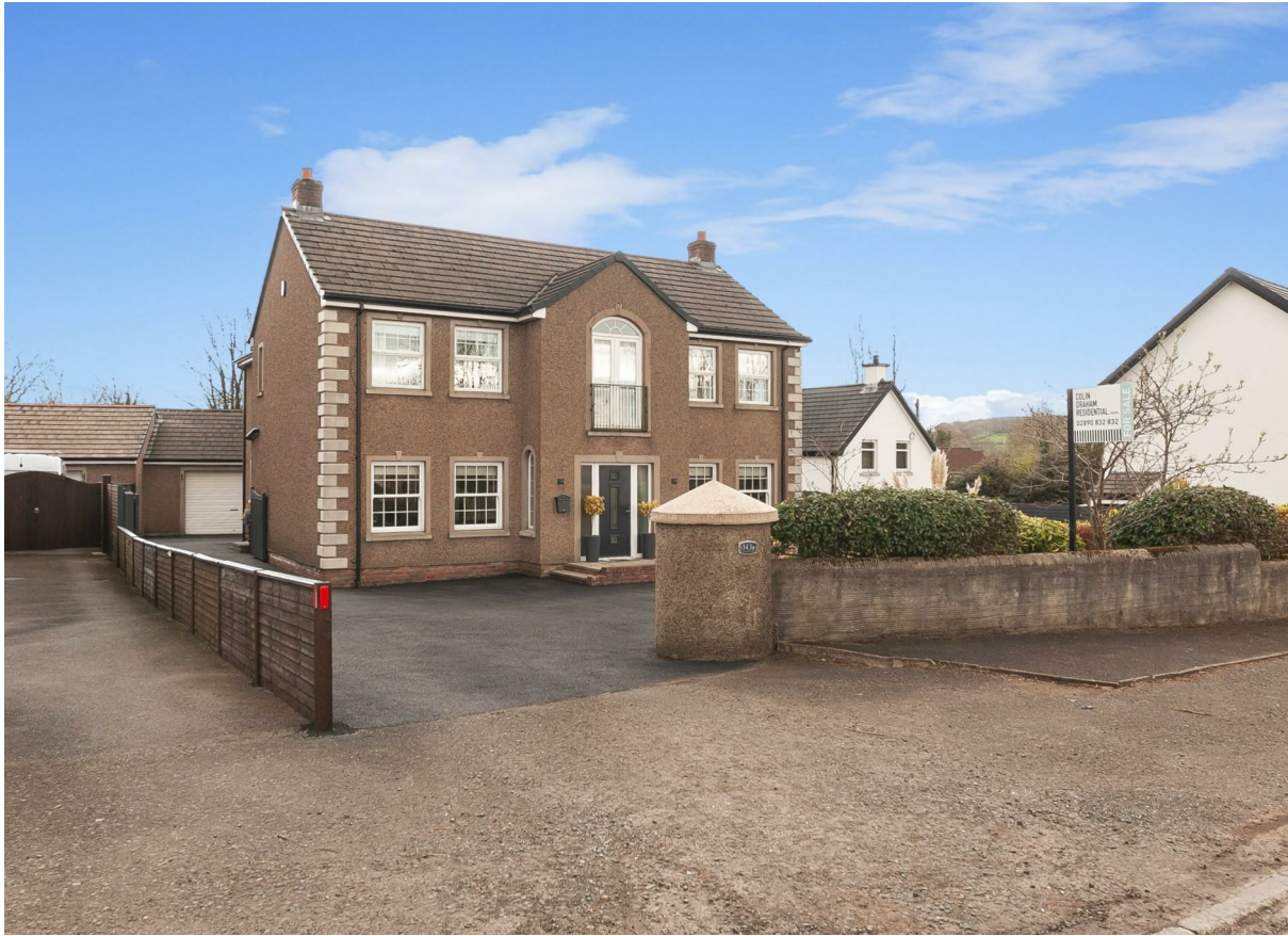
'Cartmel', 143a Hillhead Road, Ballyclare, BT39 9LN