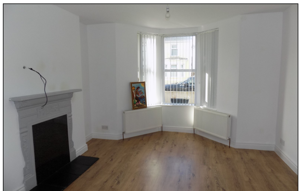
To Let - 29 Coleraine Road, Portstewart £850 per month inc rates