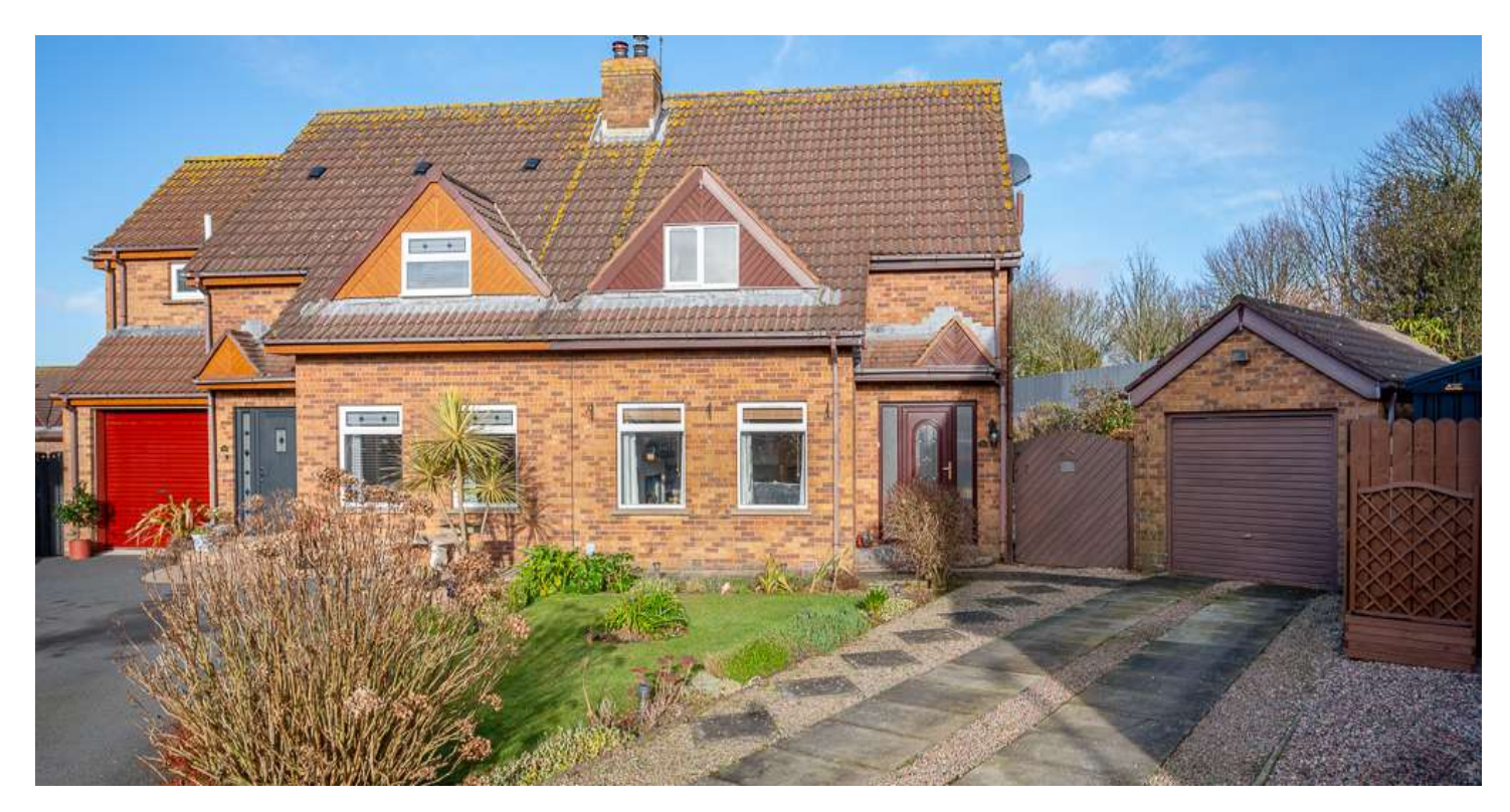
SEMI-DETACHED | 3 ⊨ | 1 ≒ | 3 ⊟

Backing onto the Water Tower and with direct access here is an ideal opportunity to purchase an exceptional extended semi detached property tucked away at the end of a cul-de-sac within this small popular development.