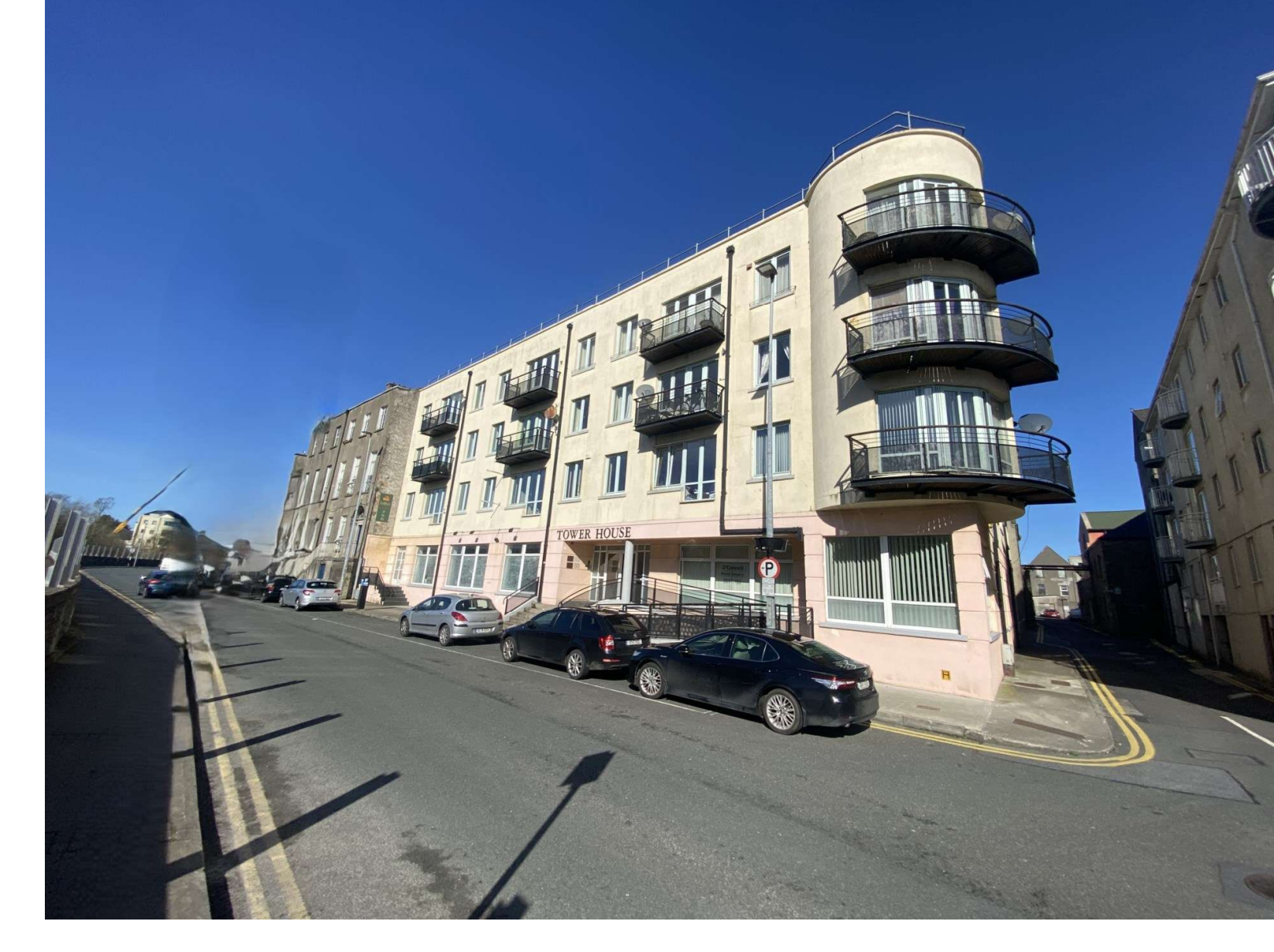
Unit 15, Tower House, Clonmel, County Tipperary, E91 K2F4

Large office space of approx 225Sq. Metres (2422Sq. Ft.) for rent in Clonmel town centre