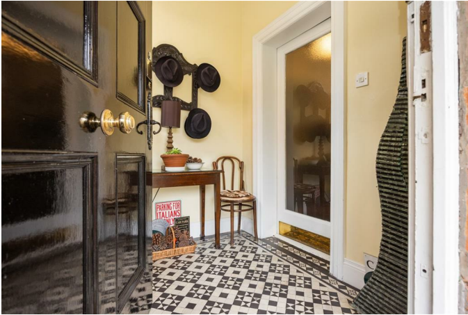
Hardwood front door, original tiled floor.