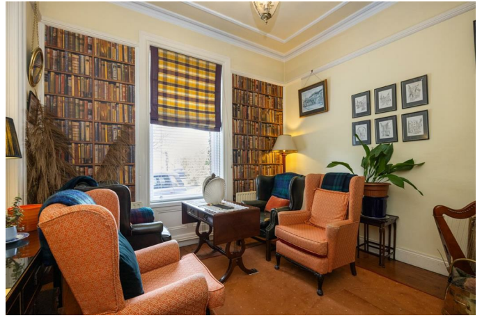
Solid wood floor, open fire.