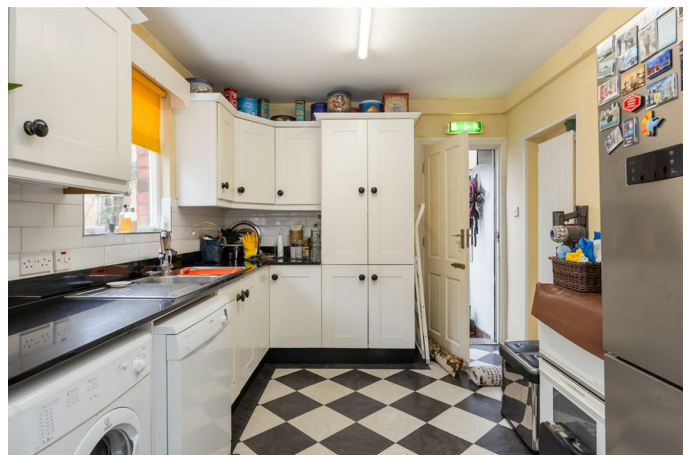
Plumbed for washing machine, tumble dryer & dishwasher, double drainer stainless steel sink unit with mixer tap, tiled flooring.