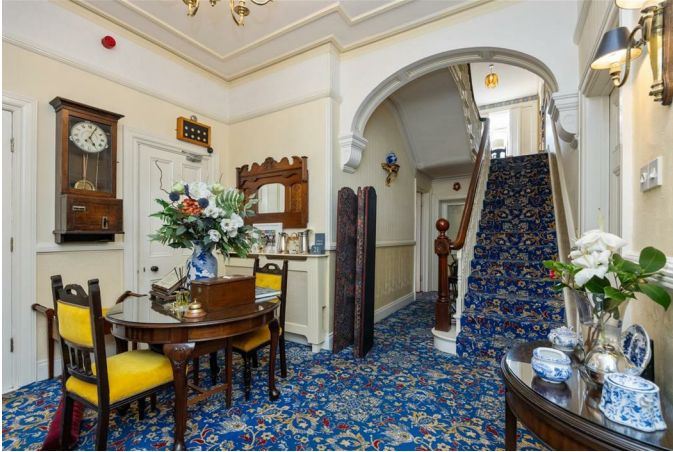
STUDY 6'6" x 4'0 (1.98m x 1.22m)