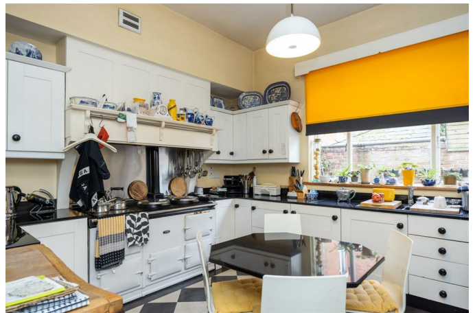
Range of high and low level units, AGA, granite work surfaces, sink unit, original wood beam, pantry.