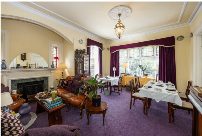
Original stain glass windows, cornicing & ceiling rose., fireplace. Bay window. Vertically sliding door which opens to lounge.