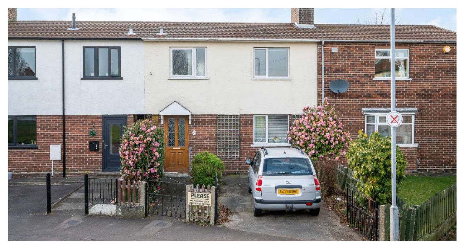
MID TERRACE | 3 ⊨ | 1 ≒ | 1 ⊟

We are delighted to bring to the market this mid terrace property, in need of modernisation, ideally situated just off Barnett's Road in East Belfast.