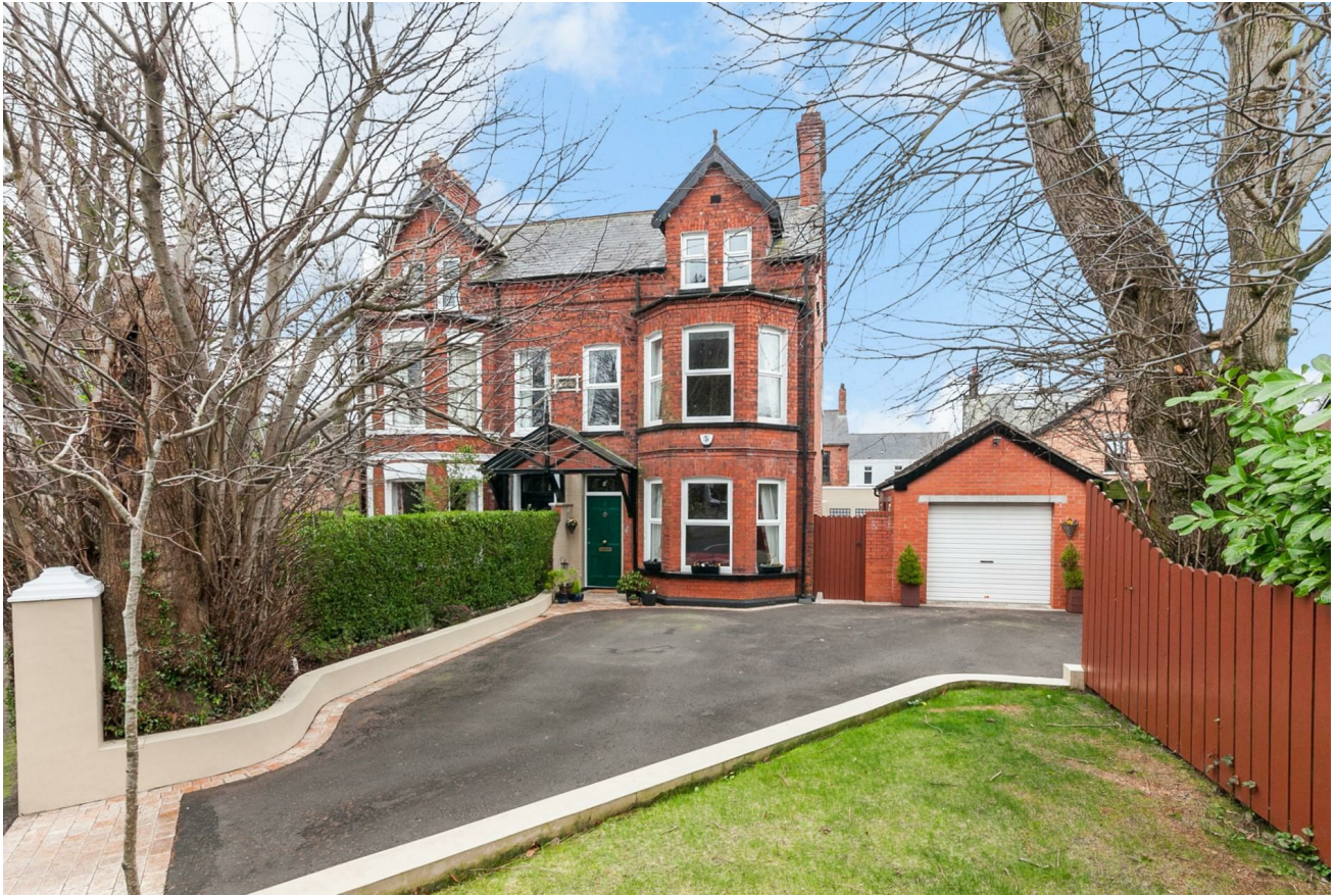
'Ingleside', 6 Old Cavehill Road, Belfast, BT15 5GS