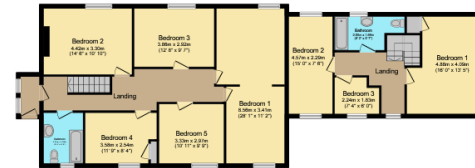
First Floor Floor area 144.6 m 2 (1,556 sq.ft.)