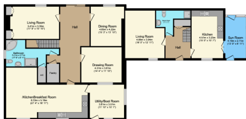
Ground Floor Floor area 195.6 m 2 (2,106 sq.ft.)