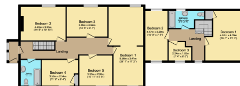
First Floor Floor area 144.6 m 2 (1,556 sq.ft.)