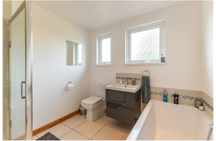
Bathroom 8'05" x 8"

This modern bathroom offers a contemporary design with a neutral colour scheme. It features a shower and a bath which are complemented with a stylish mosaic tile detailing along the wall.