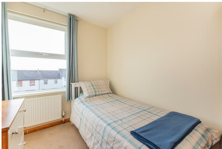
Bedroom 3 9' x 6'11"

To the front of the house there is a small single bedroom, which could also be used as an office space or walk-in wardrobe.