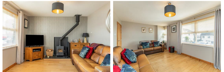
Living Room 17'06" x 11'04"

This living room is bright and spacious, featuring two windows, allowing for plenty of natural light. The light wood flooring enhances the sense of space and adds warmth to the room.