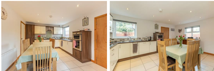
Kitchen/Dining Area 17'06 x 11'04"

The kitchen area is bright and spacious, featuring a modern open-plan layout. It includes a combination of white and wood-finish cabinetry, offering ample storage space with high and low units. The countertops are sleek and practical, complemented by a stylish tiled backsplash.