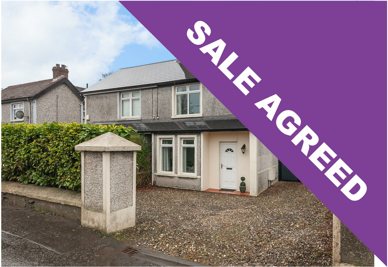
160 Ballyclare Road, Newtownabbey, BT36 5JR