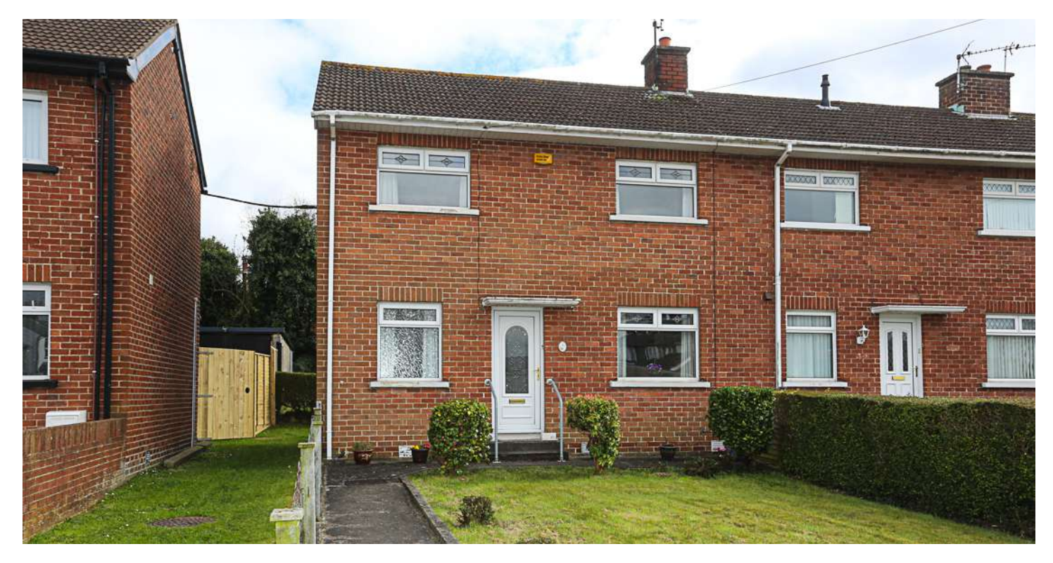
END TERRACE | 3 ⊨ | 1 ≒ | 1 ⊟

This double fronted red brick end terrace property boasts mature front and rear gardens. Internally there is bright and spacious accommodation over two floors with three well proportioned bedrooms