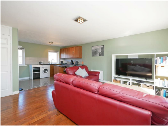
Modern Fitted Kitchen 13'6" x 7'10" (4.13m x 2.39m)