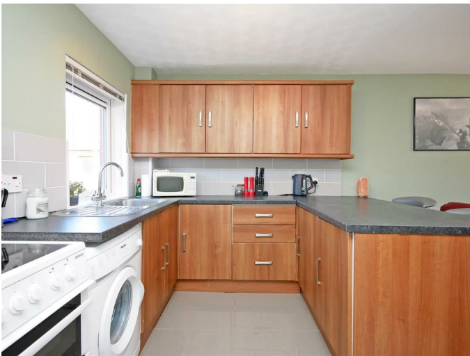
(at widest points) Modern fitted kitchen with a selection of upper and lower level units complete with formica worktops and stainless steel sink with drainer. Plumbed for washing machine. Part tiled walls and tiled flooring.