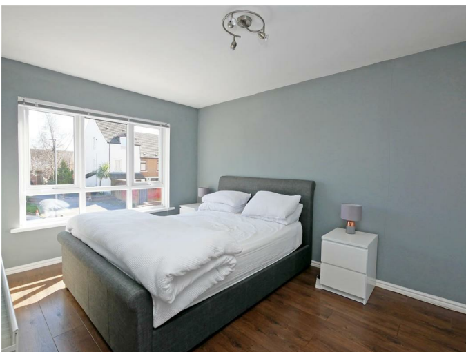
Spacious double bedroom with laminate flooring.