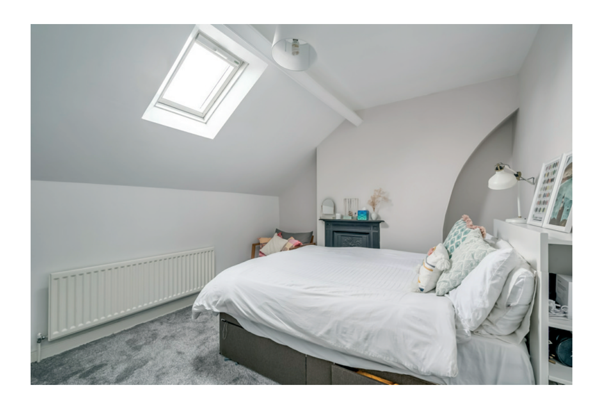
BEDROOM (4): 11' 0" x 8' 6" (3.35m x 2.59m) Skylight.

BEDROOM (3): 14' 9" x 11' 1" (4.5m x 3.38m) Skylight. Feature fireplace.