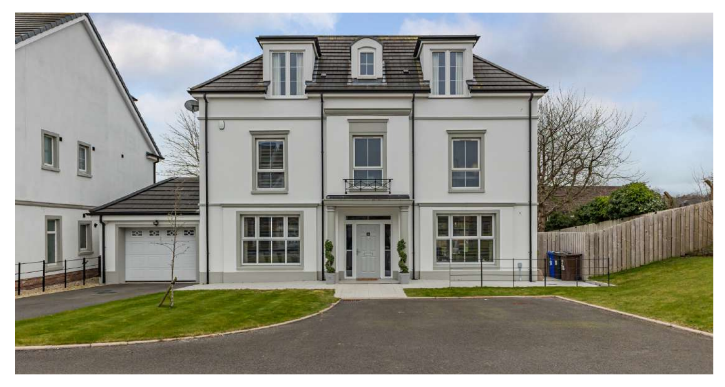
DETACHED | 5 ⊨ | 4 ≒ | 2 ⊟

Occupying arguably the best site on Rosepark Gardens. Designed to an exceptional standard throughout, this home blends modern style and family functionality.