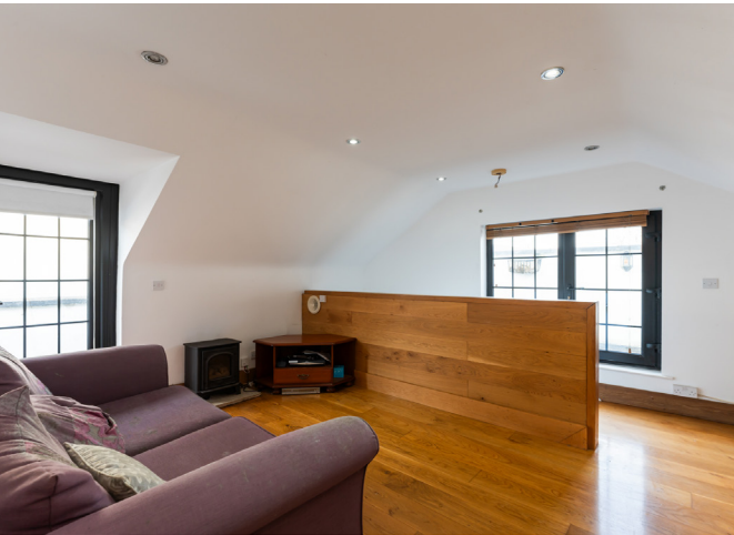
Study or ‘chill out’ area