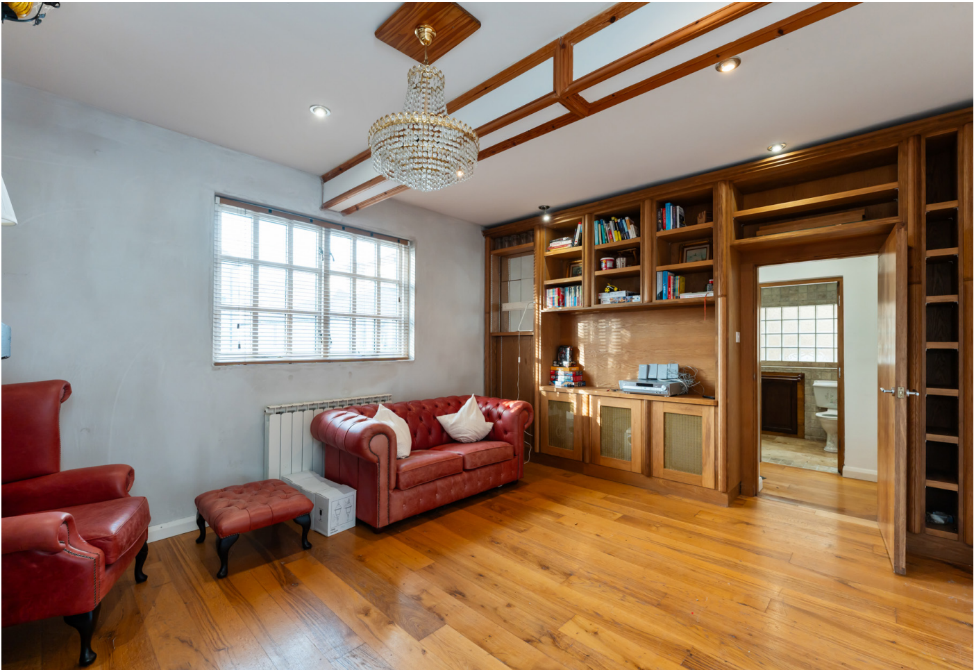
Living room of possible ground floor bedroom