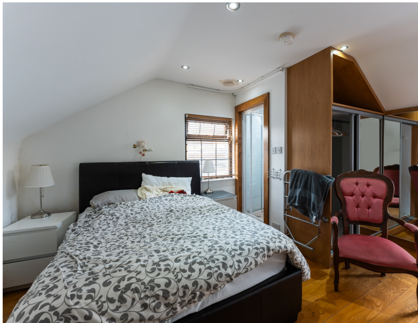
First floor bedroom with en suite and built in robes