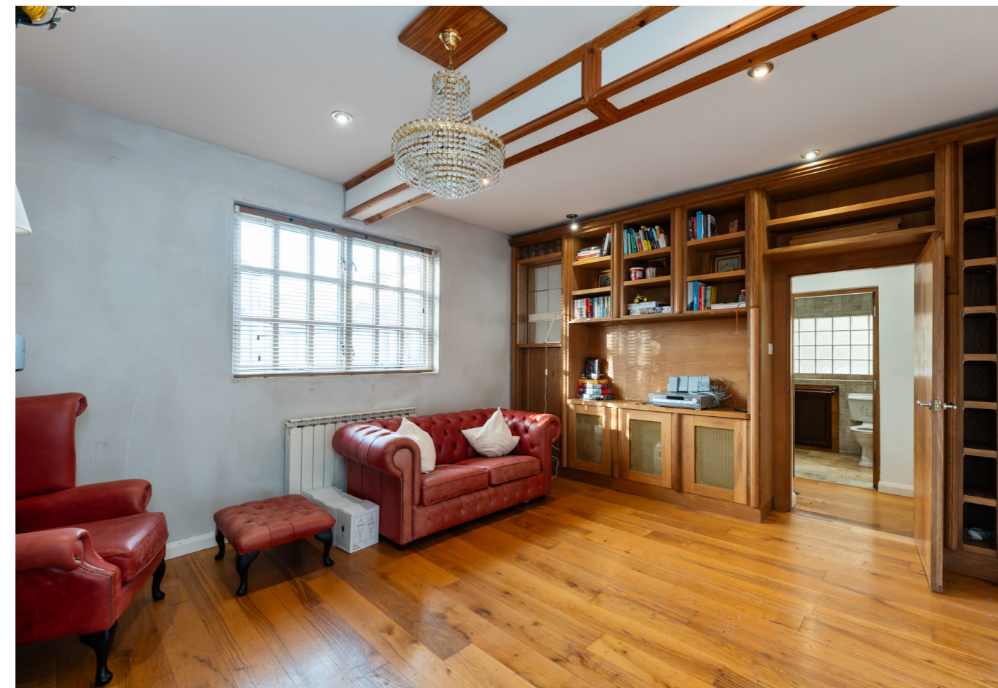
Living room of possible ground floor bedroom