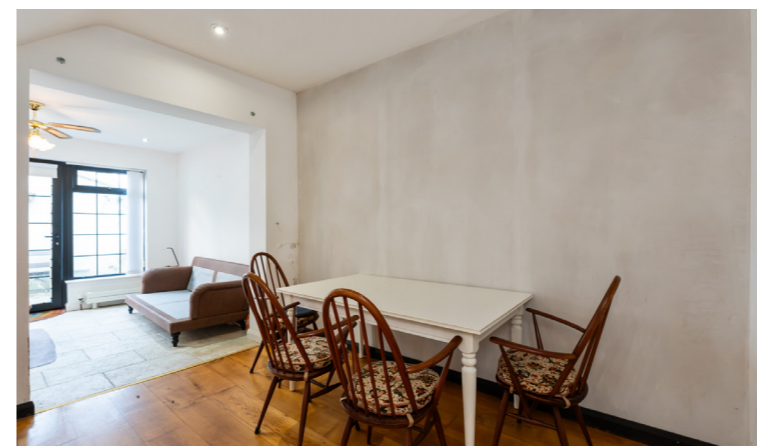
Dining open to Sitting room