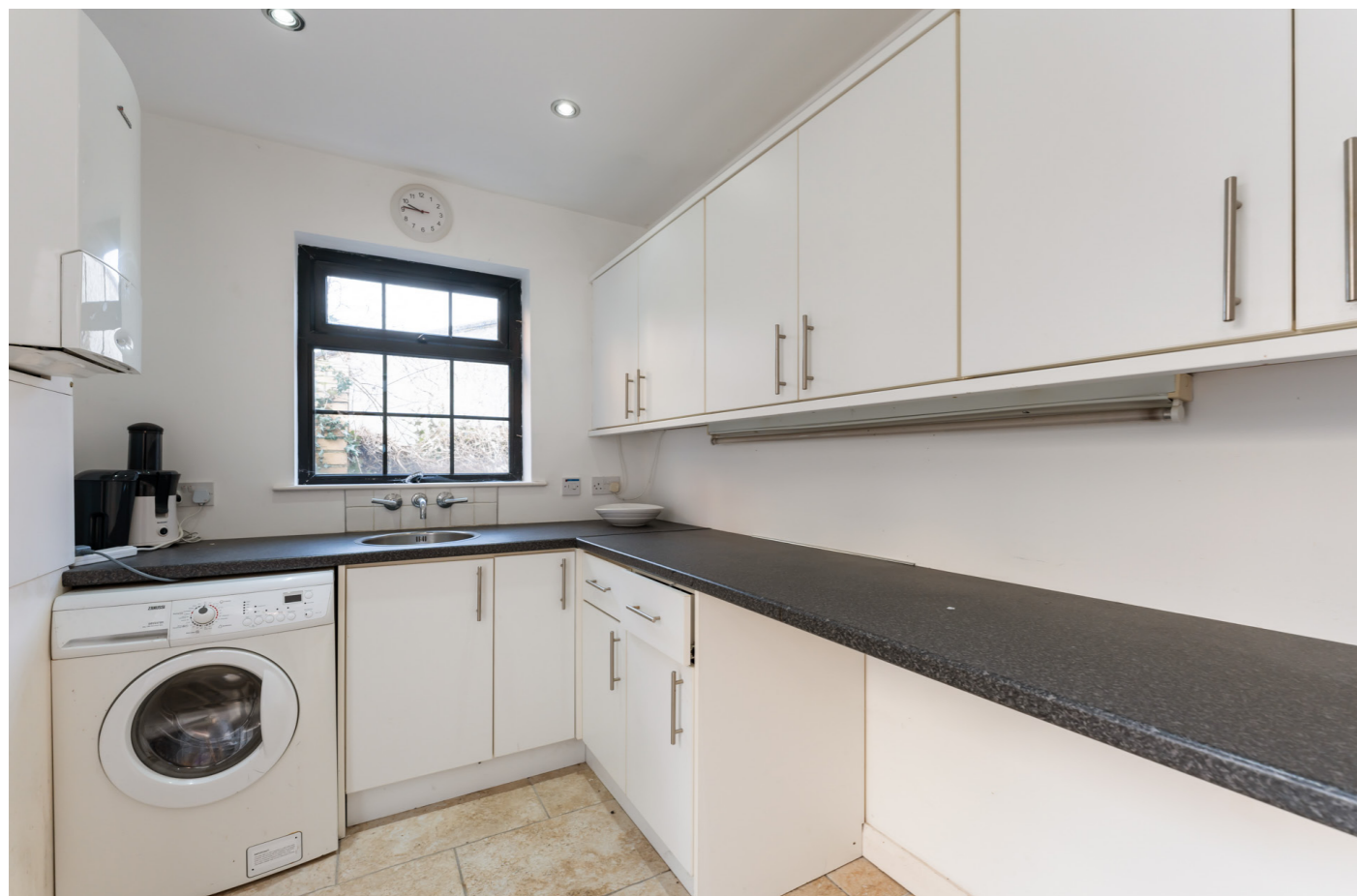
Separate utility room