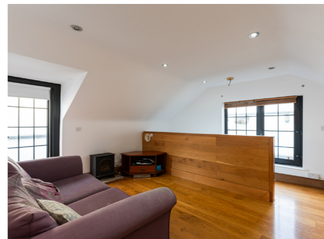
Study or 'chill out' area