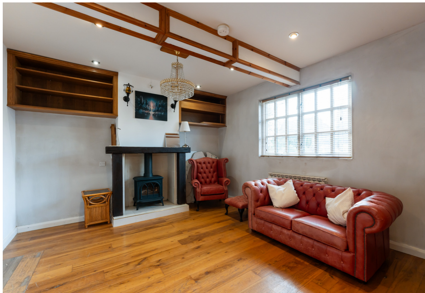
Living room or possible ground floor bedroom