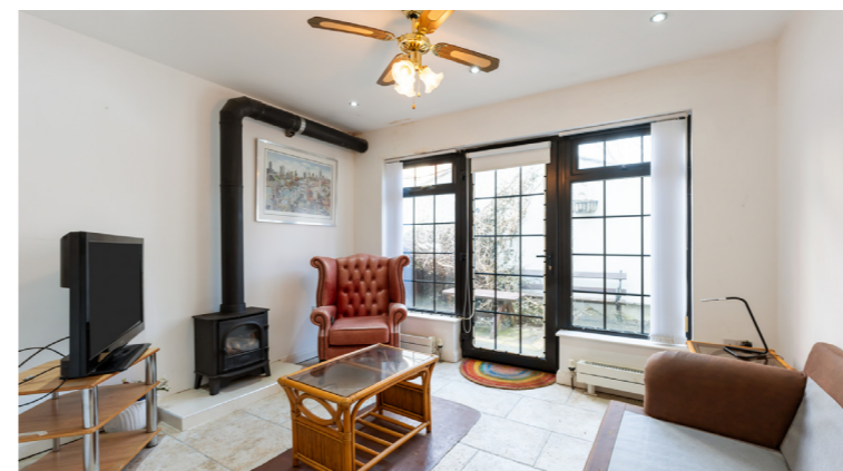
Sitting room out to courtyard