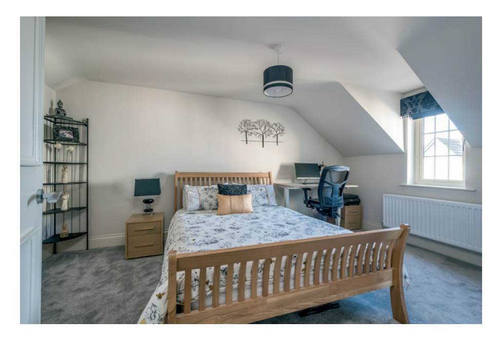
BEDROOM (3): 11' 9" \times 10' 2" (3.58m \times 3.1m) Laminate wooden floor.