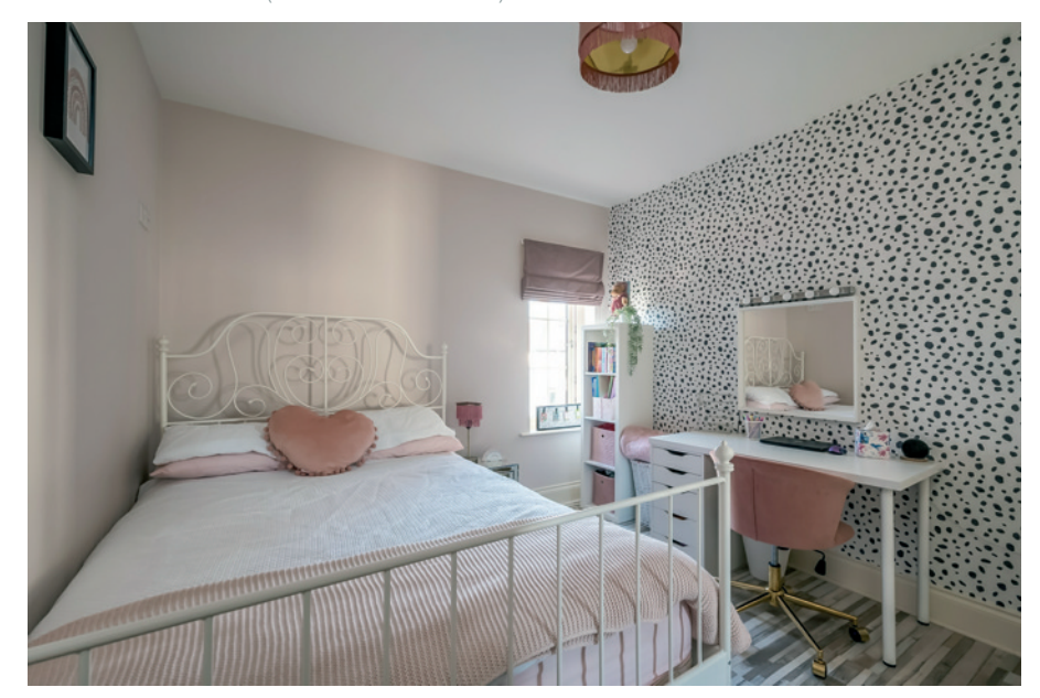
BEDROOM (4): 12' 1" \times 10' 2" (3.68m x 3.1m) Laminate wooden floor, dual aspect windows, hatch to roofspace.