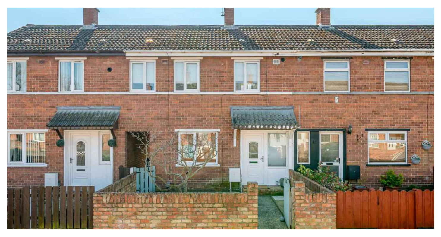
MID-TERRACE | 3 ⊨ | 1 ≒ | 1 ⊟

We are delighted to bring to the market this well presented three-bedroom midterrace property ideally situated in Sydenham, a popular residential area of East Belfast.