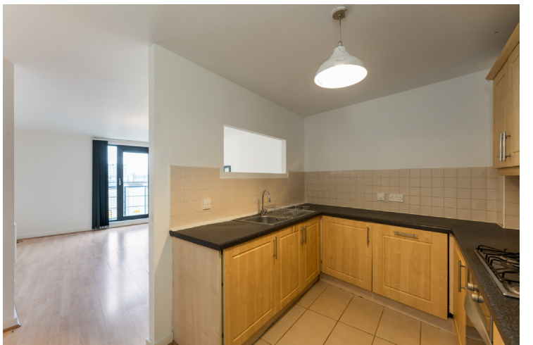
Kitchen/ Iliving area