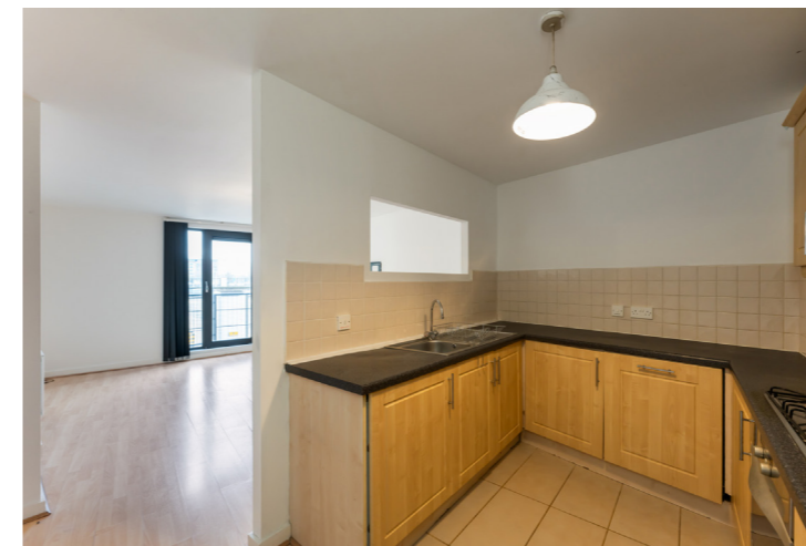
Kitchen/ living area